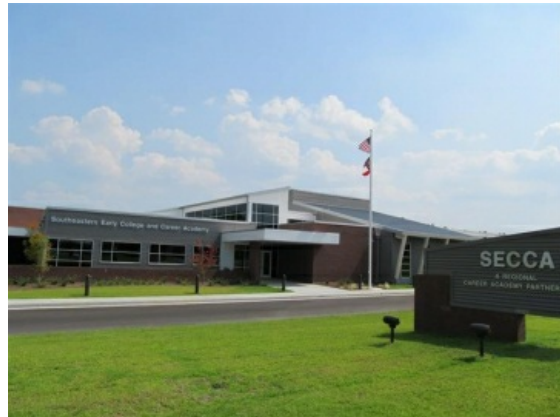
Pictured Above: The Southeastern Early College and Career Academy facility is located on the Vidalia Campus of Southeastern Technical College.

The community is hopeful that the availability of a new option in education at SECCA will help reduce the high school drop out rates and improve workforce readiness.